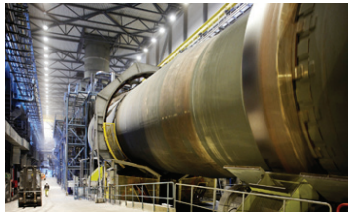
The 40-meter long kiln furnace.