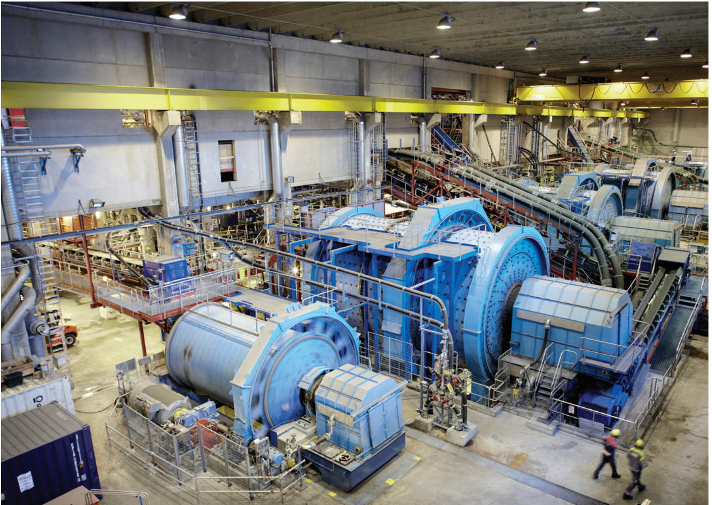
The new processing and pelletizing plant is an enormous facility with the capacity to produce five million tons of pellets each year.