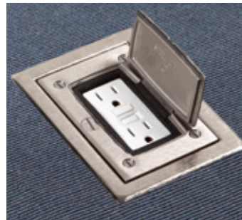
01 Nickel finish with GFCI receptacle.