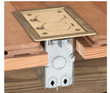
02 Brass finish with duplex receptacle.

ABB Installation Products Inc. Electrification Products Division 860 Ridge Lake Blvd. Memphis, TN 38120