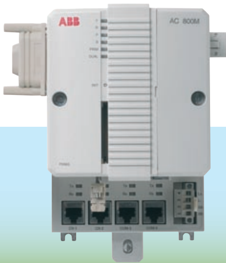
Figure 1: The AC 800M controller