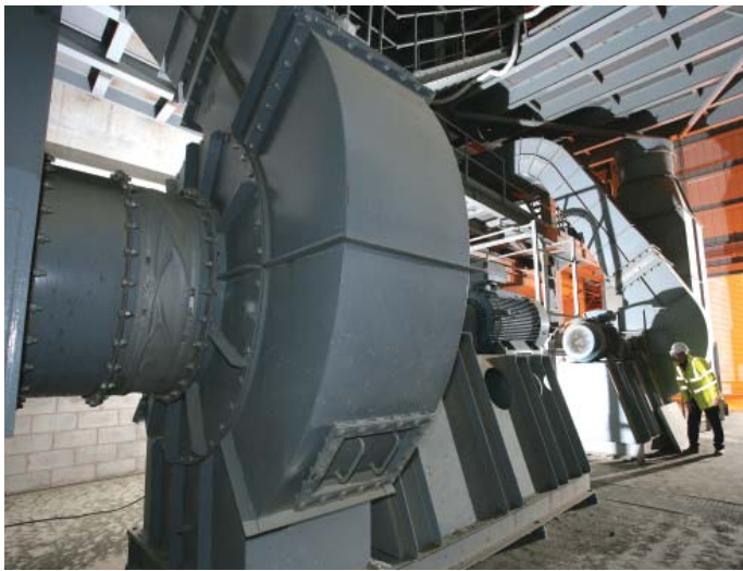
ABB drives can provide the biggest energy saving potential for fans.