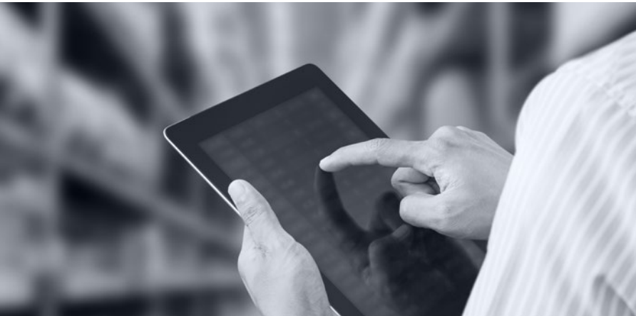
ABB Ability™ Axis Procure-to-Pay Automation replaces paper-based processes with an electronic collaboration platform. The solution covers all core P2P processes, including request for quote, purchasing, shipment, invoicing, discrepancy and remittance, with options for all supplier types.

Delivering efficiencies and automation to the supply chain through the cloud