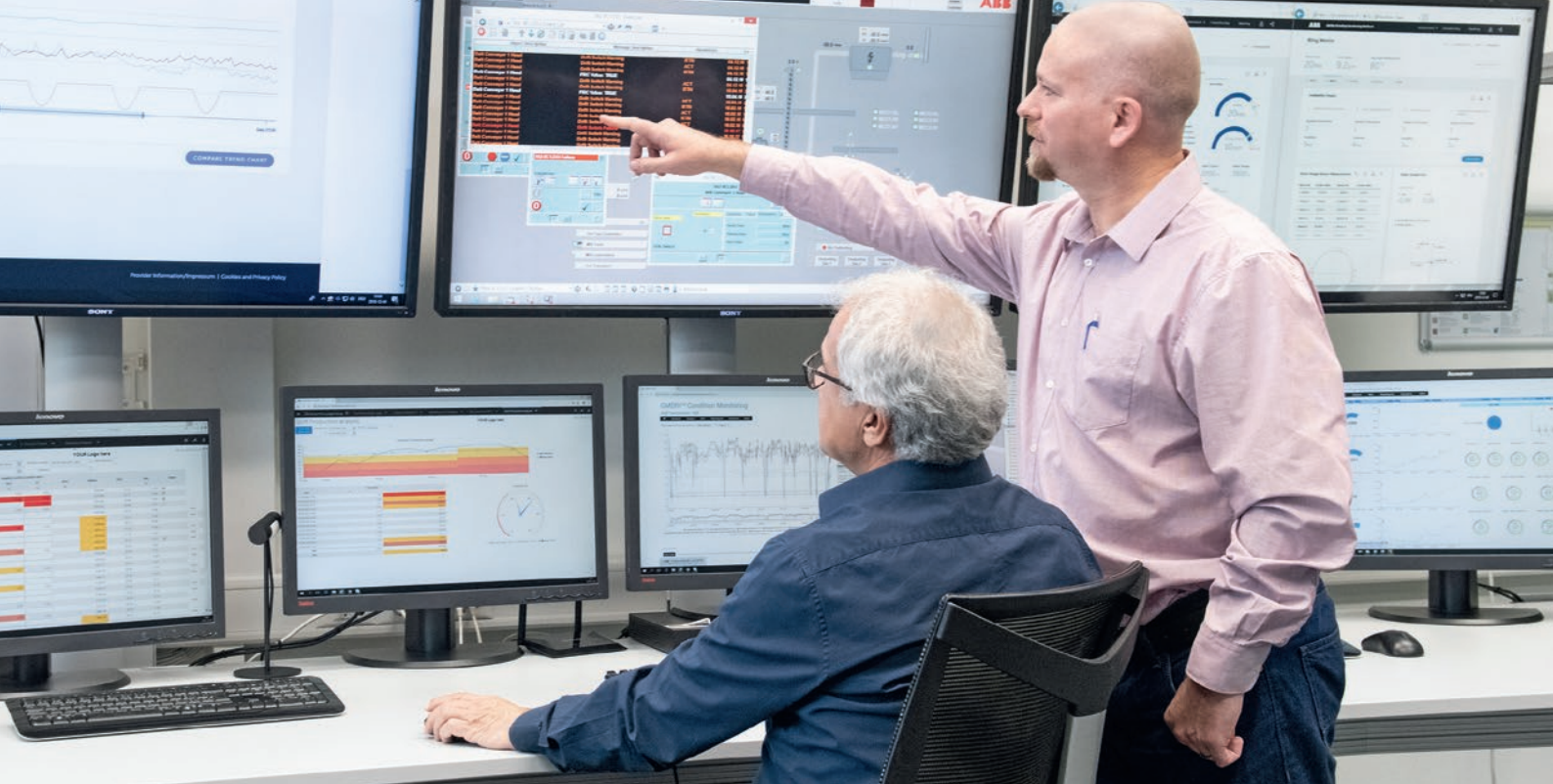
ABB Ability Predictive Maintenance, Asset Health and Remote Assistance services for grinding ensure that you can plan your maintenance tasks more efficiently, minimize downtime and optimize your overall equipment effectiveness (OEE).