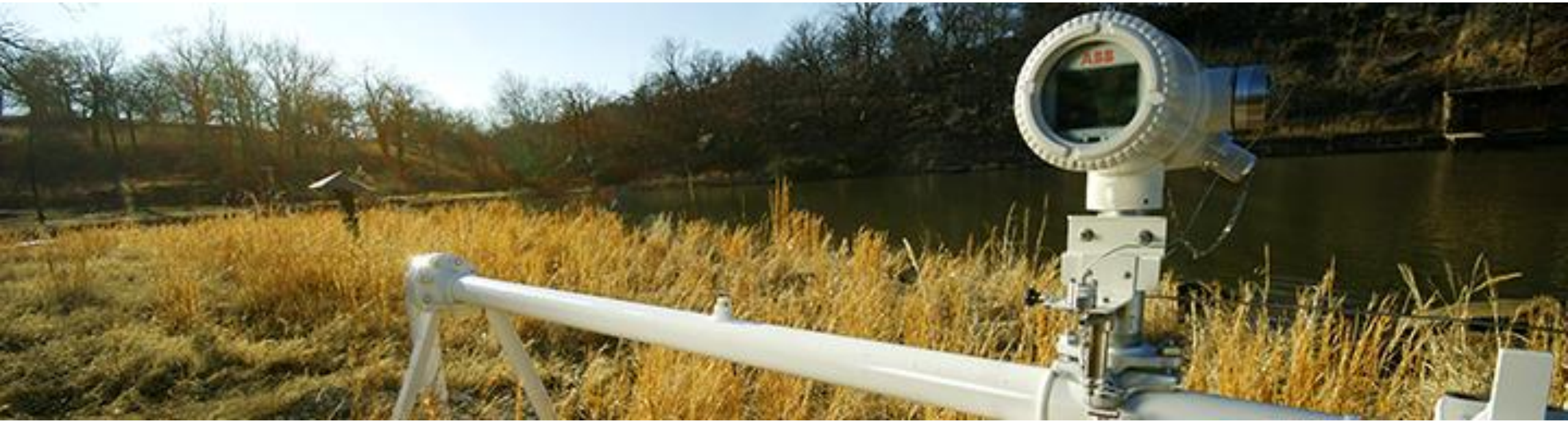
ABB Measurement Care – Performance Guarantee Option

Taking Care of Your Gas Chromatographs Service Needs