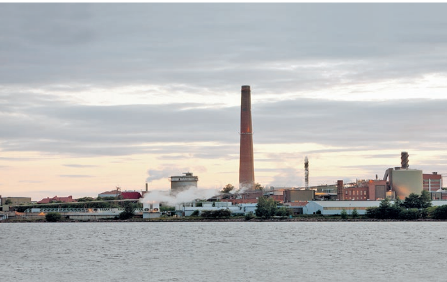
ABB Ability™ Manufacturing Execution System helps Kotkamills Oy cut costs

When Kotkamills Oy receives an order – 200 tonnes of magazine paper, for example – from a customer in western Europe, it takes an average of 28 days before the shipment is delivered. This period forms a multi-stage logistic chain that includes many variables. An essential aspect of Kotkamills’ day-to-day operations is a smooth order-production-delivery process made possible by ABB’s Manufacturing Execution System (MES).