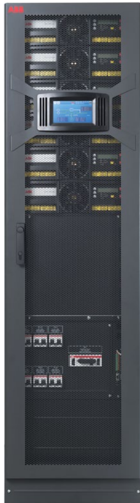
ABB Power Protection SA Via Luserte Sud 9 6572 Quartino, Switzerland

We reserve the right to make technical changes or modify the contents of this document without prior notice. With regard to purchase orders, the agreed particulars shall prevail. ABB AG does not accept any responsibility whatsoever for potential errors or possible lack of information in this document.