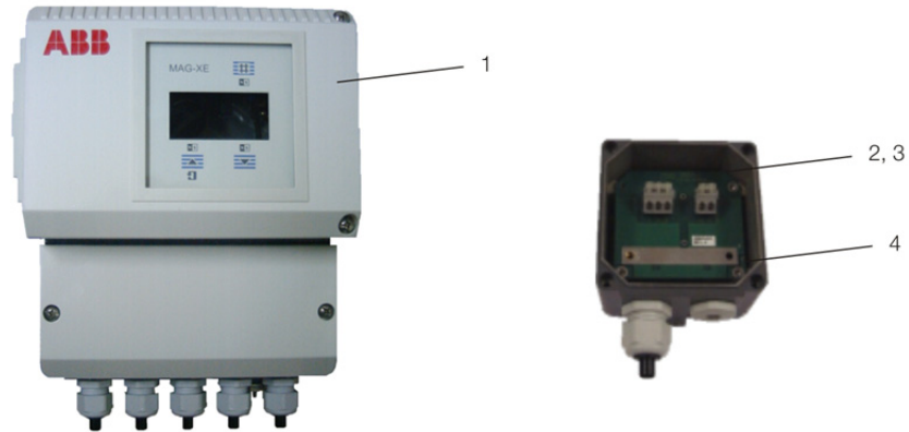
Fig. 2: MAG XE4