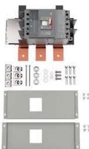
MB Breaker Kits with breakers