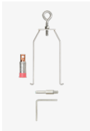
200 Amp deadbreak elbow connector accessories