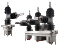
15 Elastimold® vacuum reclosers