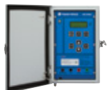
17 Fisher Pierce 5400 series capacitor controller