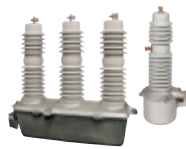
16 Joslin Hi-Voltage™ VSV capacitor switches