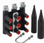
8 Blackburn Storm-Safe® service entrance disconnect