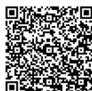
ABB Installation Products F&B Extreme temperatures