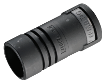
Conduit Adapter IP68