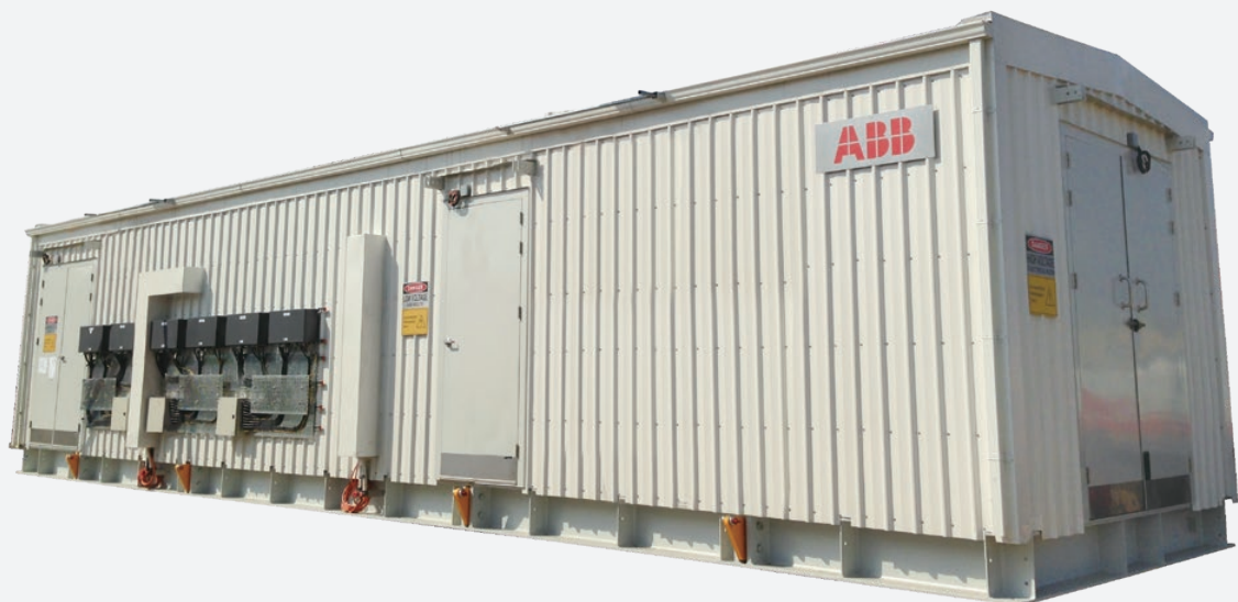
ABB Modular Systems Solution Electrical Houses (eHouse)