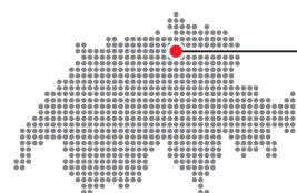
ABB installed the world's first 170 kV GIS in Zurich, Switzerland