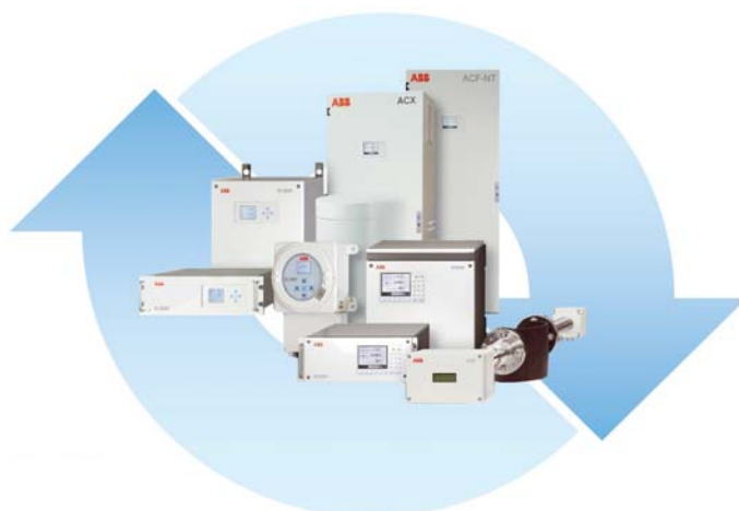
ABB provides all major international certificates for CEMS, hazardous area installations, metrological approvals, electrical safety and quality and environmental management.