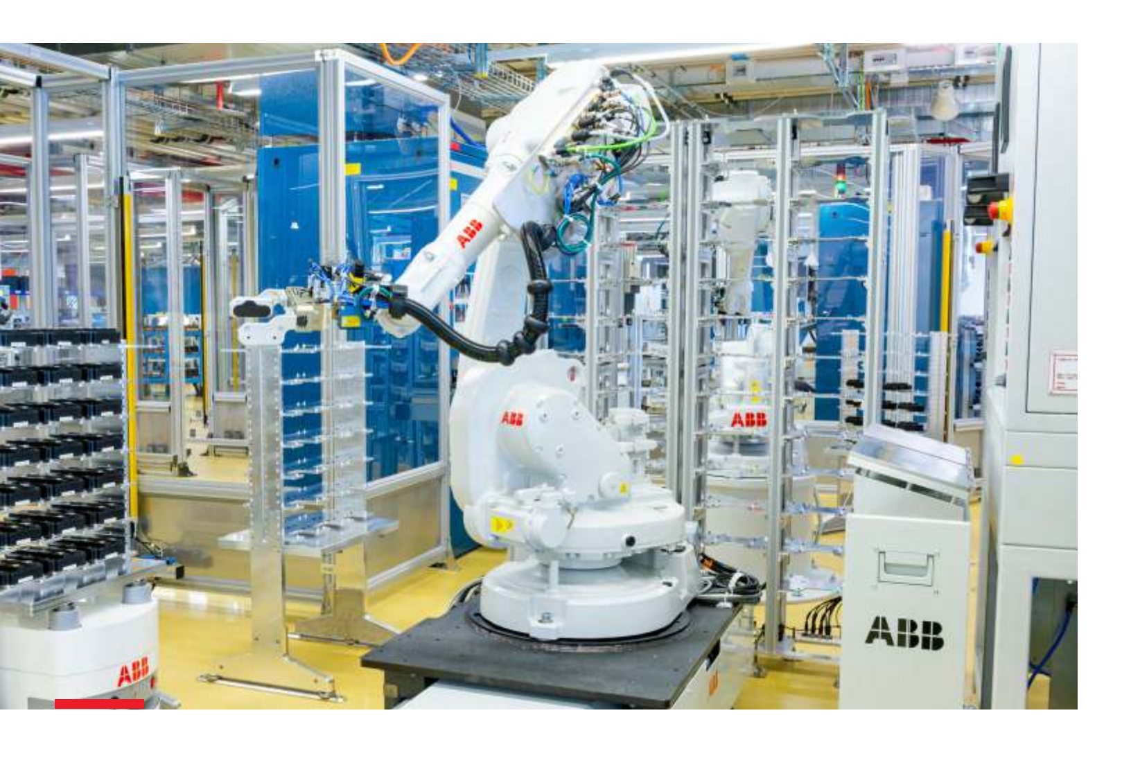
ABB Ability<sup>™</sup> Smart Manufacturing Operations Management Suite