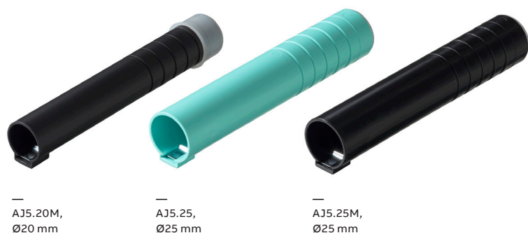
AJ5.20M, Ø20 mm