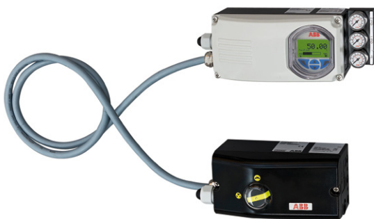
EDP300 remote sensor