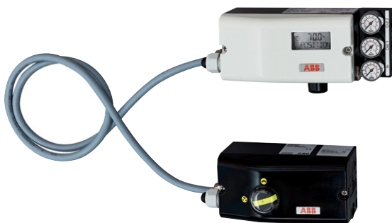
TZIDC remote sensor