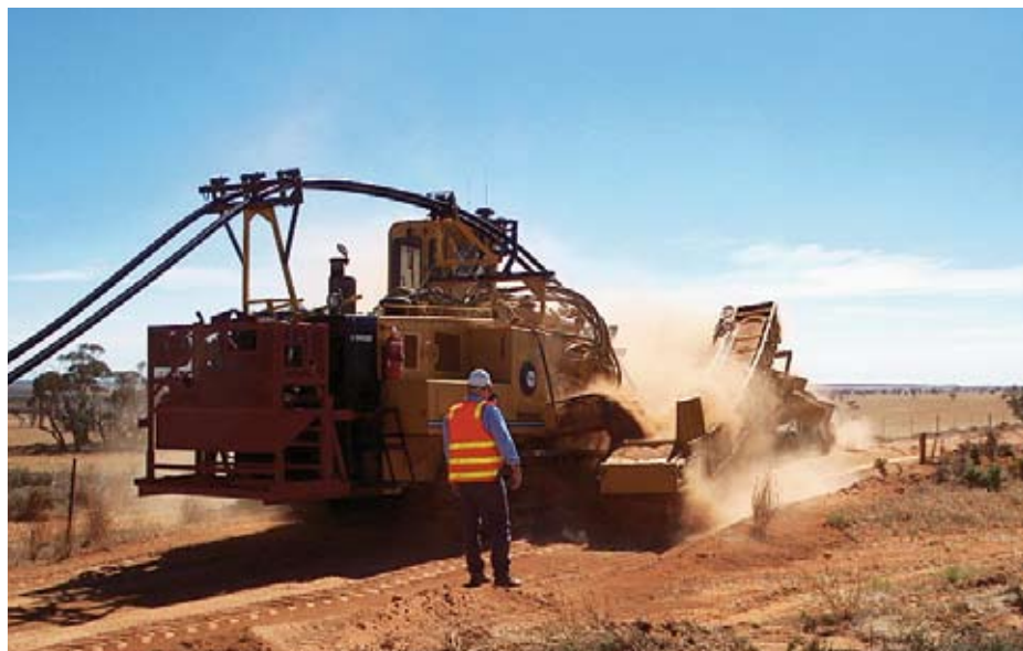
Trenching and laying of land cables in Australia