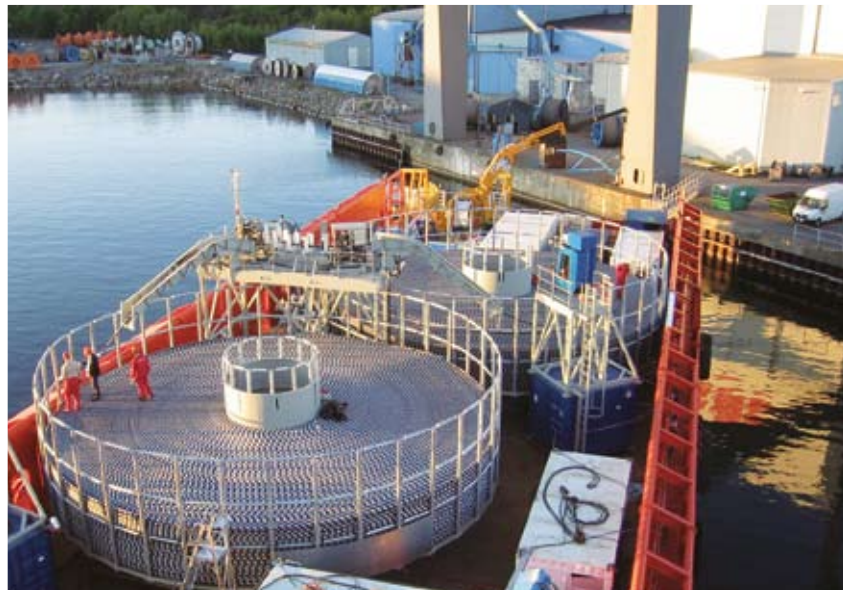
Cable loaded on board the laying vessel, directly from the ABB high voltage cable factory