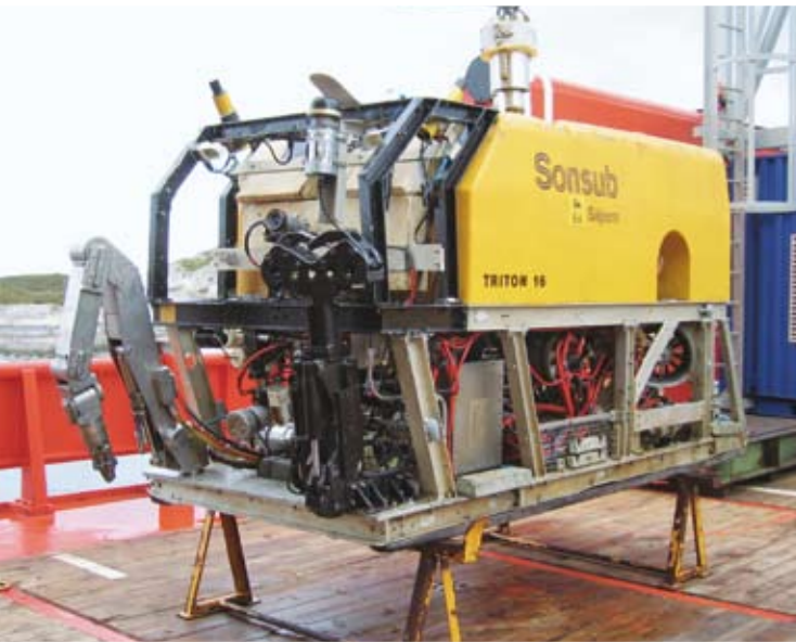
ROV, Remote Operated Vehicle for under water monitoring of submarine cable laying