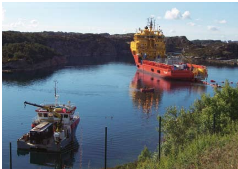
Laying the submarine HVDC Light cable to the Troll A gas platform in the North Sea