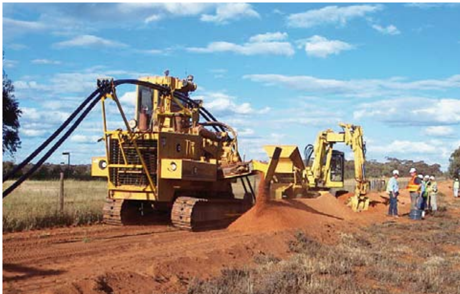
The light and robust HVDC Light cables can be laid with very cost efficient laying methods