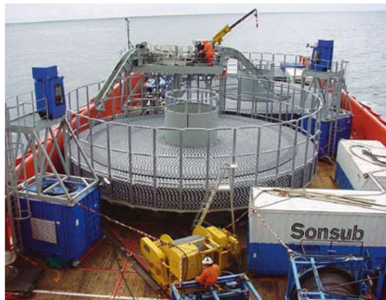
Cable on turntable on the cable laying vessel