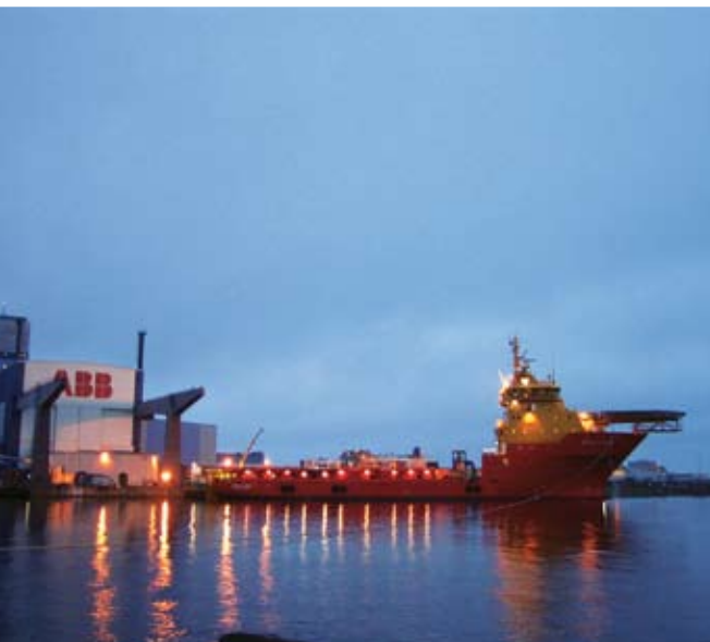
Cable laying vessel at the ABB harbor