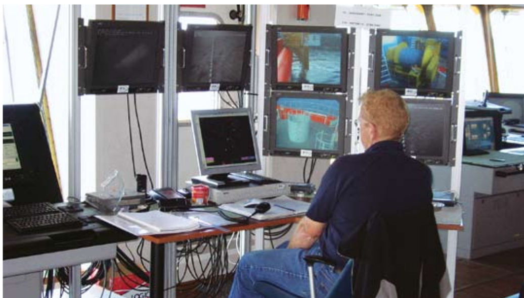
The precision work of submarine cable laying is closely monitored in every step