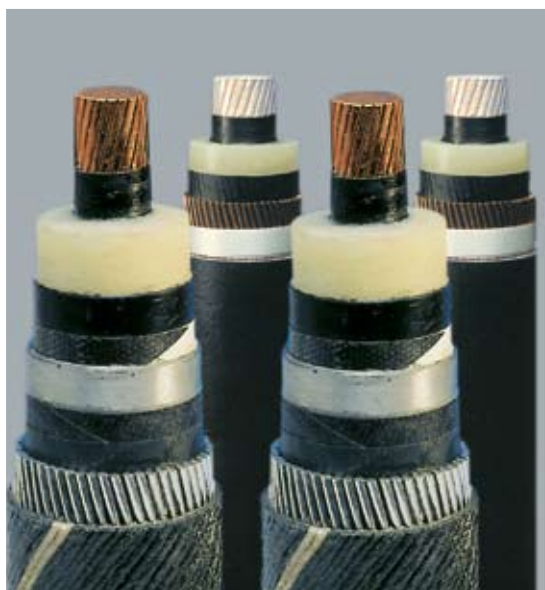
Submarine and land HVDC Light cables