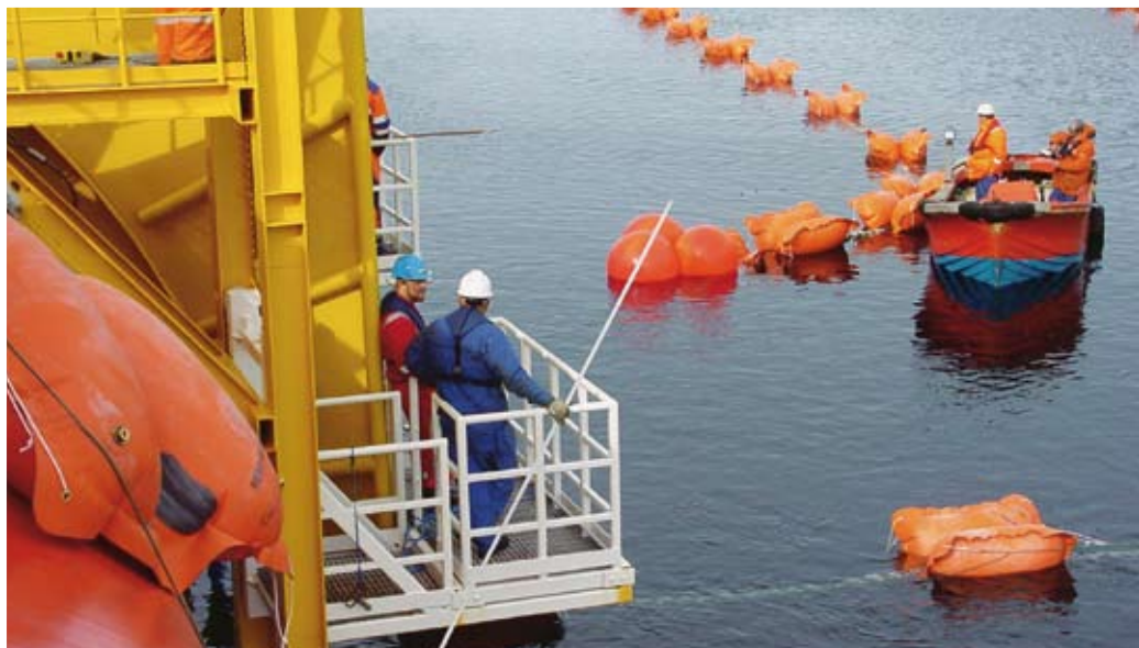
We produced and installed MurrayLink, the world's longest land cable