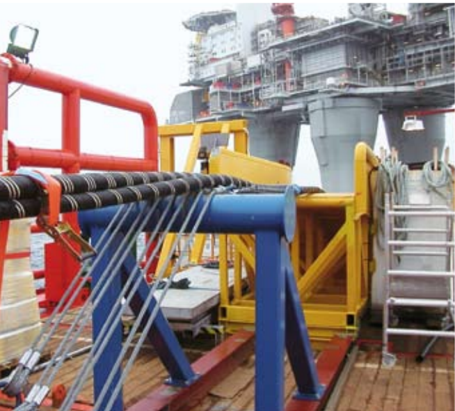
The HVDC Light cables to offshore platform