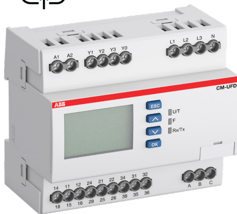
01 CM-UFD.M22M with Modbus RTU

The CM-UFD.M22M's display, communication interface, pre-setting and Modbus RTU ensure that installation and configuration times are reduced by up to 60%.