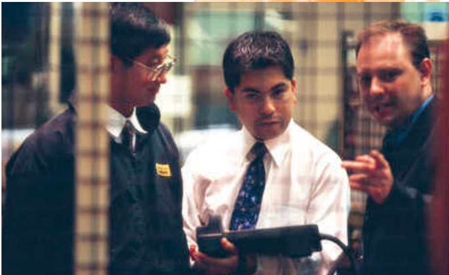
ABB Performance Services offer a wide range of value-enhancing services dedicated to accelerating return on investment by reducing cost and increasing asset effectiveness. From short-term consulting engagements to long-term, value-based outsourcing, we're dedicated to improving your asset performance.

Getting the most from your assets requires an in-depth knowledge of both process strategy and the equipment used to enact that strategy. In many cases, the in-depth expertise required to make value-generating business decisions regarding automation is widely distributed, or lacking altogether.