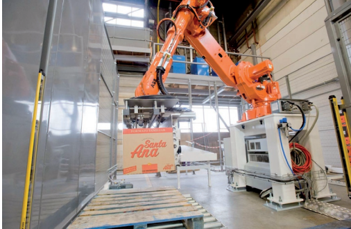
ABB CSi Case Being safe saves space and money