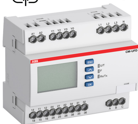
01 CM-UFD.M33M with Modbus RTU

The CM-UFD.M33M's display, communication interface, pre-setting and Modbus RTU ensure that installation and configuration times are reduced by up to 60%.