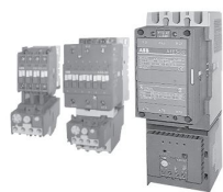
Open Starters - IEC