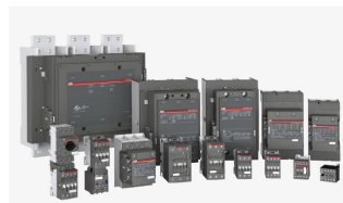
AF Contactor and MS Components