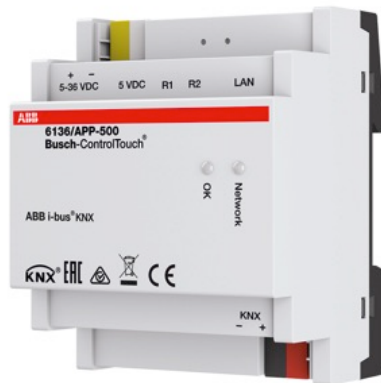
ABB ( www.abb.com ) is a leading global technology company in power and automation that enables utility, industry, and transport & infrastructure customers to improve their performance while lowering environmental impact. The ABB Group of companies operates in roughly 100 countries and employs about 135,000 people.

The REG device for Busch-ControlTouch® is the core of the system.