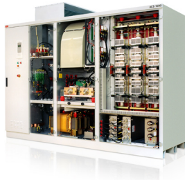
ABB medium voltage drives product overview