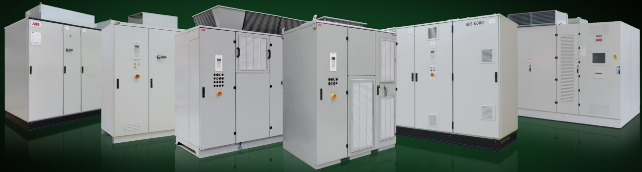
ABB medium voltage drives Product overview