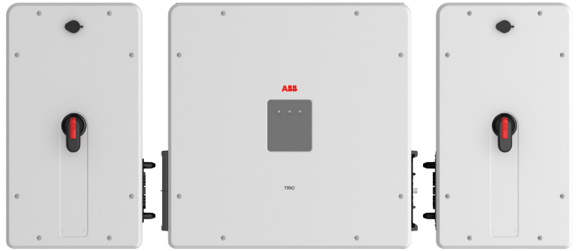
ABB string inverters TRIO-50.0-TL-OUTD-US 50 kW