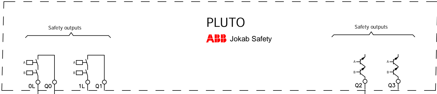
ABB Jokab Safety

NOTE! Pluto and the Sentry safety relays must be placed in the same enclosure to achieve PL e