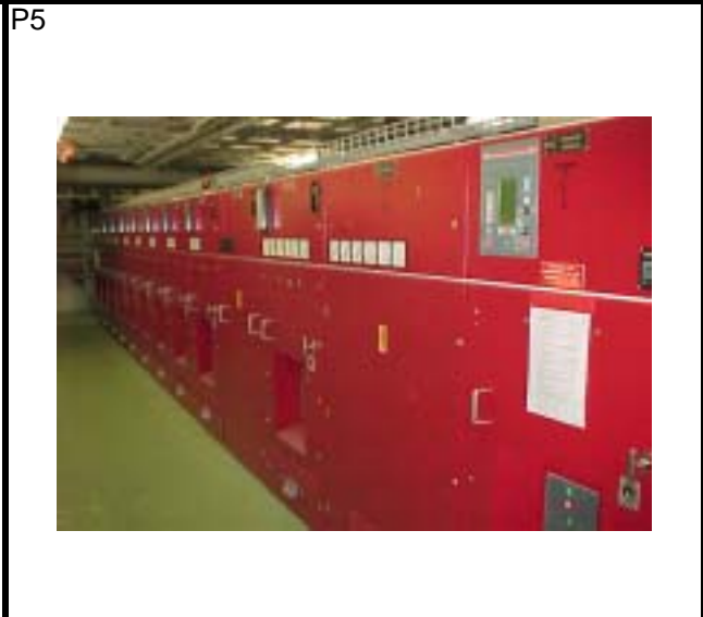
ABB Retrofit solution