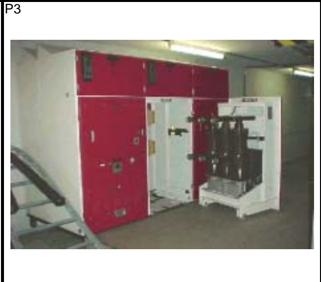
ABB Retrofit solution

Manufacturer Brown Boveri (BBC) Switchgear name BA/BB Switchgear Product HB Breaker Ratings Current (A) <= 2500 Voltage (kV) <= 24 Fault Rating (kA) <= 40 Also manufactured by Asea Brown Boveri and Sécheron AG