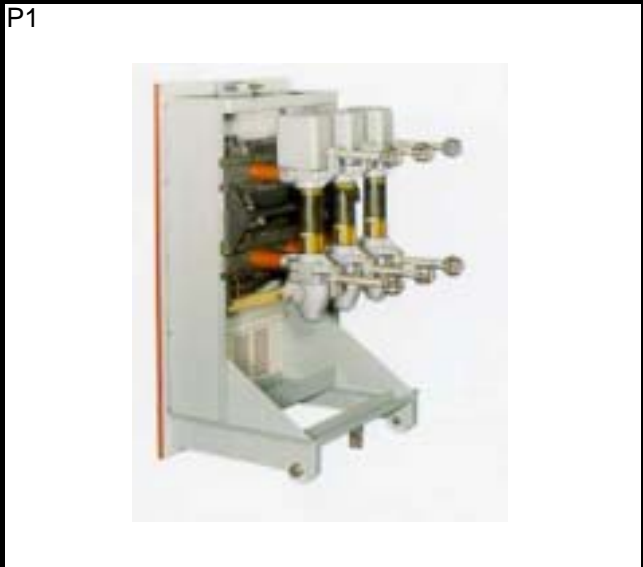
ABB Retrofit solution