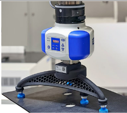
Handling Sets ECBPi