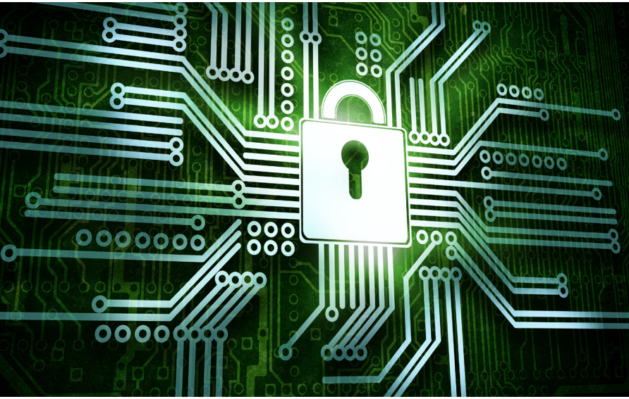
ABB Power Generation Care delivers tested and validated control system security patch updates for power generation facilities.

Security has become a major concern for Power Generation owner/operators. ABB understands the need for our customers to maintain a secure, reliable, control environment with minimal time and effort expended.