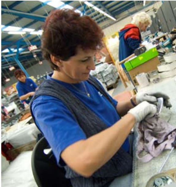
Although FlexArc could handle virtually all of the assembly process with ease, so far EDP is continuing to use human welders alongside FlexArc.