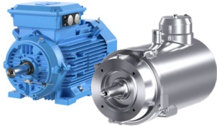
ABB offers a broad portfolio of motors for the food and beverage industry that will help you achieve better efficiency and reliability without compromising food safety.