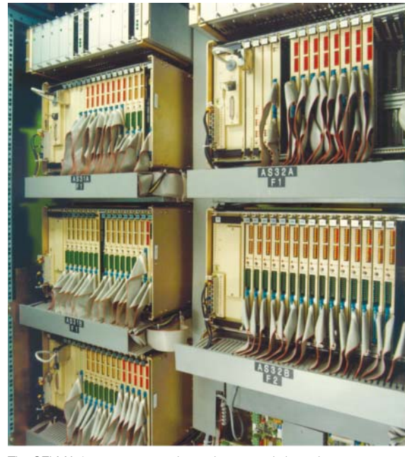
The SELMA 2 system preventive maintenance is based on ABB's extensive knowledge and experience of manufacturing and maintaining SELMA 2 systems for more than 20 years and takes environmental and operational conditions into account. Qualified specialists perform on-site preventive maintenance work.

A detailed service report including recommendations for future actions is provided once the maintenance work has been completed and inspection data fully analyzed.