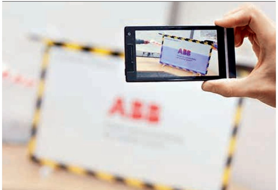
2 The prototype for showing tank values in a camera view of a mobile device

and fire. Additionally, rescue teams can utilize the location functionality of such devices to locate personnel still in the plant.