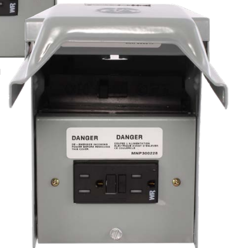
Non-automatic switch model TNA60RGFR