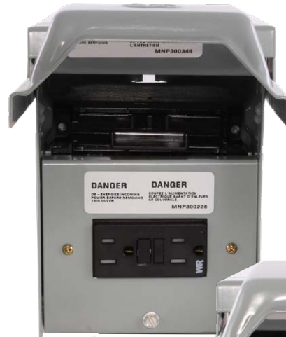
Non-fused pullout model TFN60RGFR