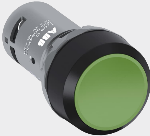
ABB pilot devices are engineered for total reliability. Our products are tested to extremes and proven in the toughest environments. Their innovative designs simplify the entire process, from selection to installation.

The Compact non-illuminated pushbuttons CP are the most efficient solution, reducing both installation time and cost thanks to the all-in-one design. It is perfect for tough environment thanks to the market leading level of dust and water resistance.