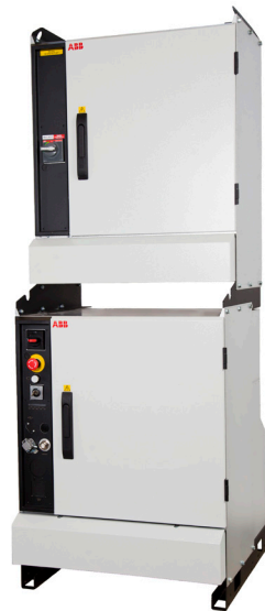
ABB offers a compact and flexible Spot Welding Cabinet that is ready to fulfill your most demanding requirements. The Spot Welding Cabinet is a member of the IRC5 controller family and an integrated part of ABB's robot system. Its design ensures high quality and high performance spot welding.