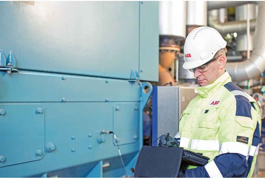
ABB Ability™ Condition Monitoring for shaftlines is an advanced on-site condition monitoring service that enhances the reliability of the entire shaftline, including motor, gearbox and driven load. It detects electrical and mechanical issues affecting the rotor, bearings, gearbox and other critical components, which account for a significant share of total failures.

ABB Ability™ Condition Monitoring for shaftlines is an on-site condition monitoring service that provides early and accurate defect detection, allowing for proactive maintenance planning and minimizing unexpected downtime.