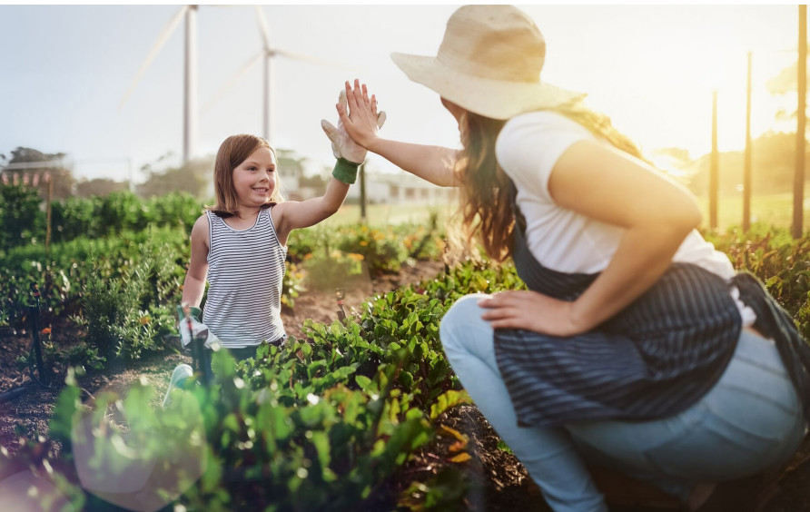
ABB Take-Back and Recycling helps customers managing their old motors and drives. The offering targets customers who need support achieving their sustainability goals and want seamless and responsible recycling from their supplier.

Your old motors and drives are worth more than you think