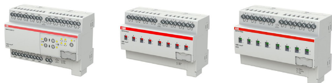
ABB i-bus® KNX switch actuators now integrated into ABB i-bus® tool