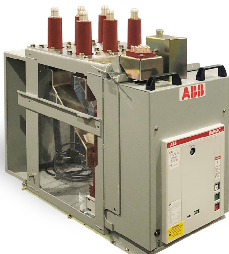
ABB incorporates proven technologies for medium voltage roll-in replacement circuit breakers, such as vacuum interrupters and operating mechanisms. Operating mechanisms that are specifically designed to operate with vacuum interrupters include the ADVAC™ spring charged mechanism and the AMVAC™ magnetic operating mechanism.