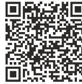
ABB Performance predictor