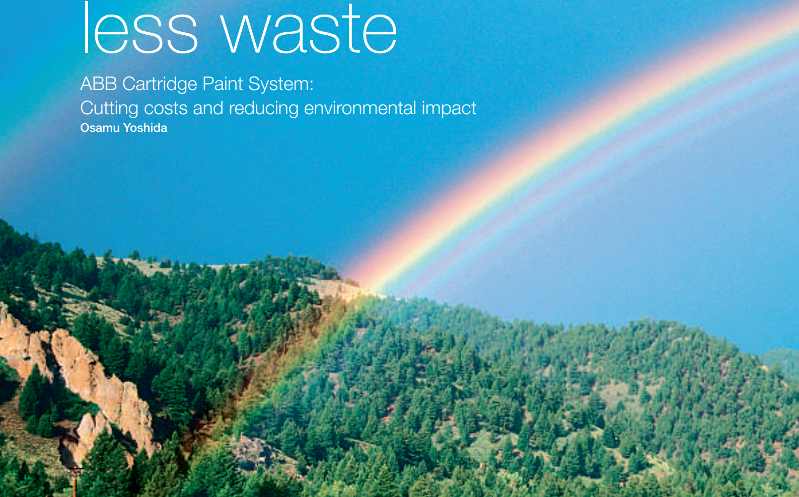
ABB Cartridge Paint System: Cutting costs and reducing environmental impact Osamu Yoshida

How many different colors should an automaker offer its customers? A famous pioneer supposedly said, "You can have it in whatever color you want so long as it's black". Today, however, it goes without saying that automakers seek to improve their market position by offering customers as many choices as possible.