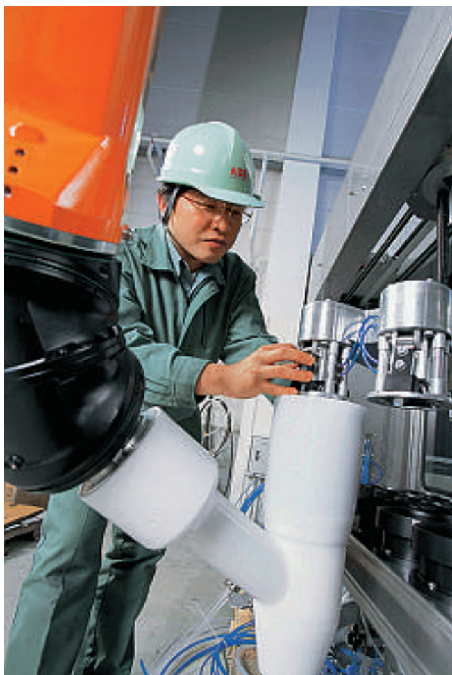
3 An ABB technician inspects a CBS installation

would be single-usage and lead only to the cartridge station. A surprisingly simple and straightforward idea! At least, as an initial concept.