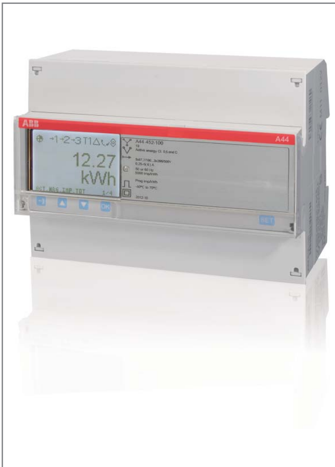
A44 energy meter from ABB