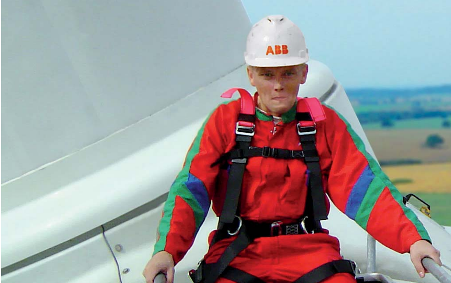
ABB life cycle services, investment peace of mind

ABB offers life cycle services to help keep customer's wind turbine converters operating like new. The ABB services portfolio allows wind farm owners and turbine manufacturers to build a tailor made package of services to fit their needs.