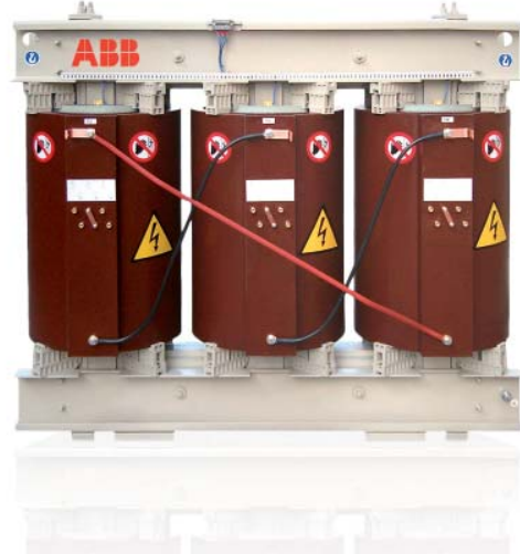
ABB transformers for wind applications include both large transformers used to connect the wind farm substation to the transmission grid, as well as smaller turbine transformers located inside the wind turbine. They are designed for harsh operating environments, specifically salty, sandy and dusty conditions in high humidity, and even in operating temperatures

as low as -25\text{ }^{\circ}\text{C} . The distribution transformers can be located in the nacelle or in the tower and are designed to convert voltage from the turbine to the wind park transmission line.