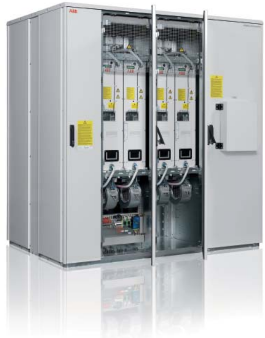
ABB full power converters over 2 MW feature a design option that uses multiple sub-converters working in parallel. During low wind speeds, the converter uses only the sub-converters needed according to the wind speed. This provides increased converter efficiency and reduced wear-and-tear on the system. The converter sub-modules may even be installed in different locations of the wind turbine providing turbine manufacturers with a degree of freedom to optimally use space in the nacelle and tower.

ABB full power converters offer high power density in a compact design. Full power converters are available in different configurations with flexible pre-engineered options. Along with the standard cabinet design, a back-to-back configuration is available.