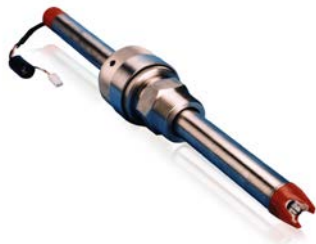
The TB557 is an example of a retractable pH sensor commonly used in bleach plant applications.

Mills typically measure pH at the inlet to each stage within the bleaching process. These sensors are mounted in the pipelines downstream from the stock pumps. Often additional pH sensors will be mounted in the larger pre-retention piping that leads into the tower on each ClO 2 Stage. The outlet pipeline from each tower will also have pH measurements as will the stock washers. Measurement of pH on the inlet and outlet of the tower gives the process engineer feedback on the effectiveness of the chemical reaction. Mills often add chemicals at each washer stage, so pH measurement within the washer provides a control measurement for proper dosing.