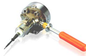
In thick stock applications (> 8%) the TB18 Safe-T-Clean Valve provides a good alternative to linear insertion style pH systems.

Beyond the descriptions here, consult ABB technical support regarding proper installation of pH sensors into pulp stock lines. ABB offers additional documentation to help in these situations.